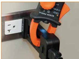
Line Splitter Accessory

⚠ WARNING: Read, understand, and follow all instructions, cautions and warnings attached to and/or packed with all test and measurement devices before each use.